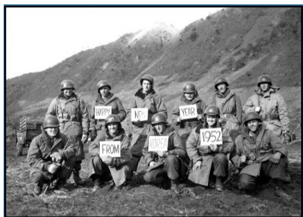
Happy New Year From Korea 1952 We Have Troops All Over the World This New Years. Take A Moment to Lift a Toast To Them

That is help that you provide just by being a member. Is it important? Just remember that The American Legion in Iowa helps more veterans with VA claims than all the other Iowa organizations put together. Would that help be possible without you? Maybe, but with you we know it will be there. Be sure you have a 2019 card.